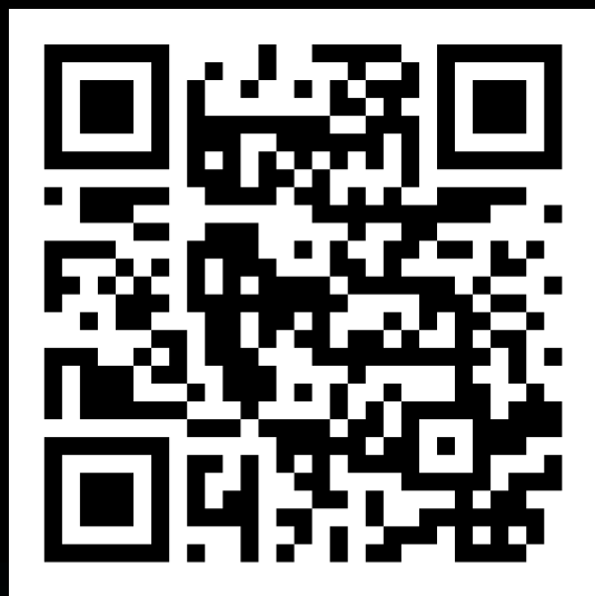
Cheap Bromo 网站