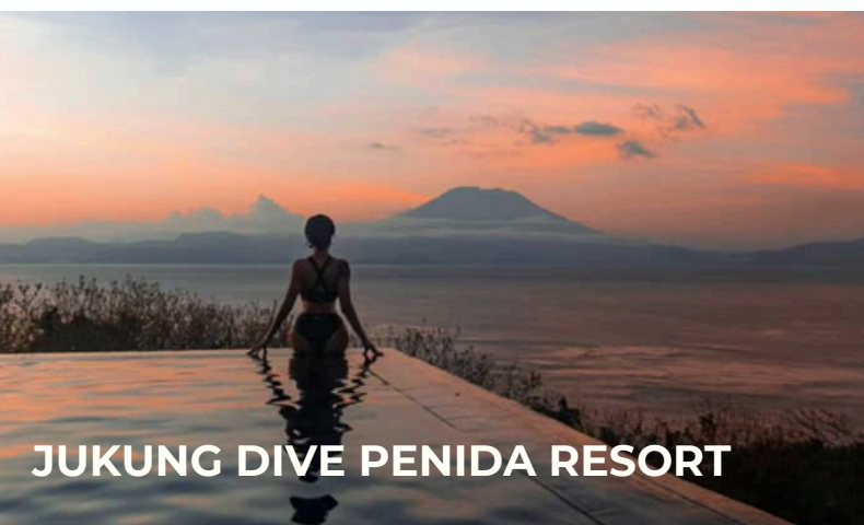
JUKUNG DIVE PENIDA RESORT