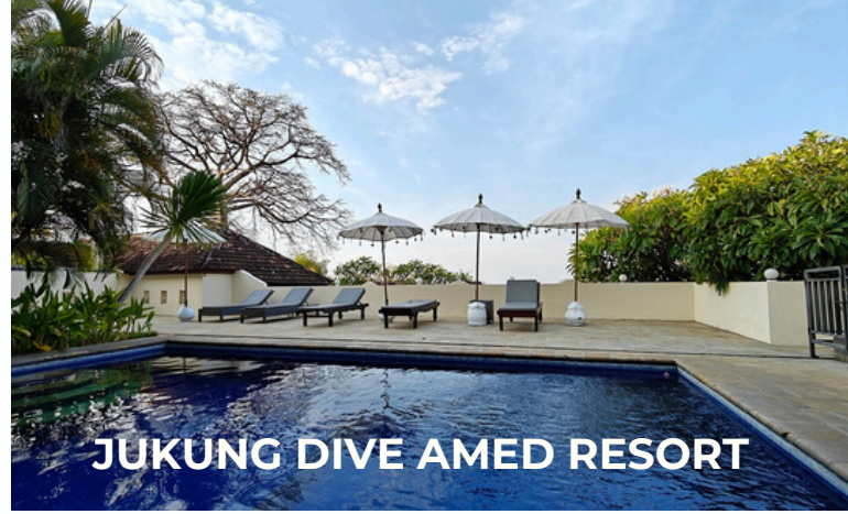
JUKUNG DIVE AMED RESORT