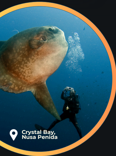
Crystal Bay, Nusa Penida

Extend your bottom time and reduce fatigue, ideal for multiple dives over consecutive days.