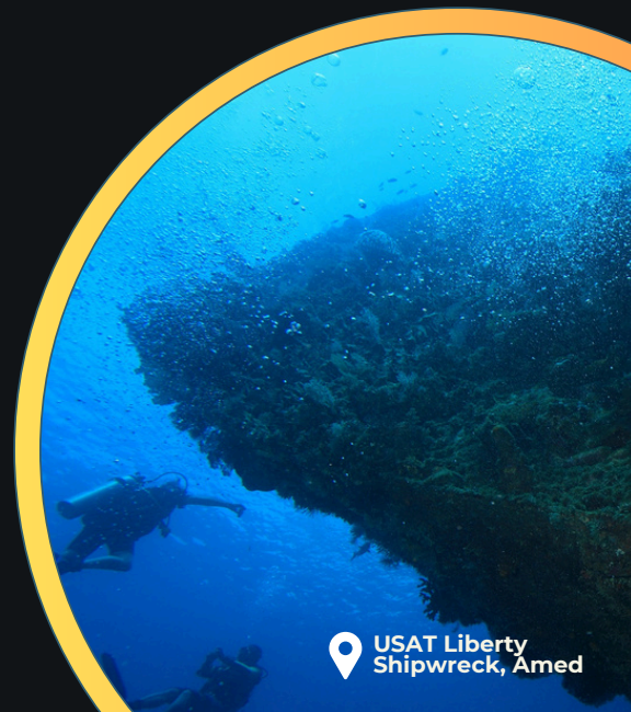
USAT Liberty Shipwreck, Amed

Build the skills and confidence to dive independently and safely.